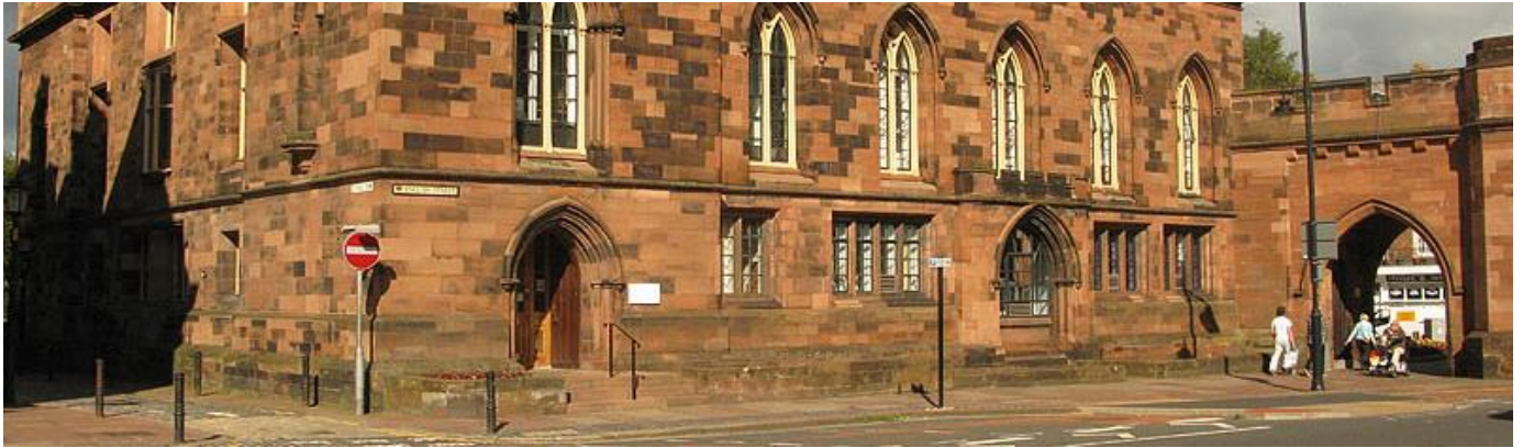
Part of Cumbria CC's offices at the Citadel, Carlisle

Cumbria County Council, together with their ICT partners Agilisys, selected the Atrium Enterprise Asset Management (EAM) software as the best solution to deliver the Council's corporate property asset management strategy