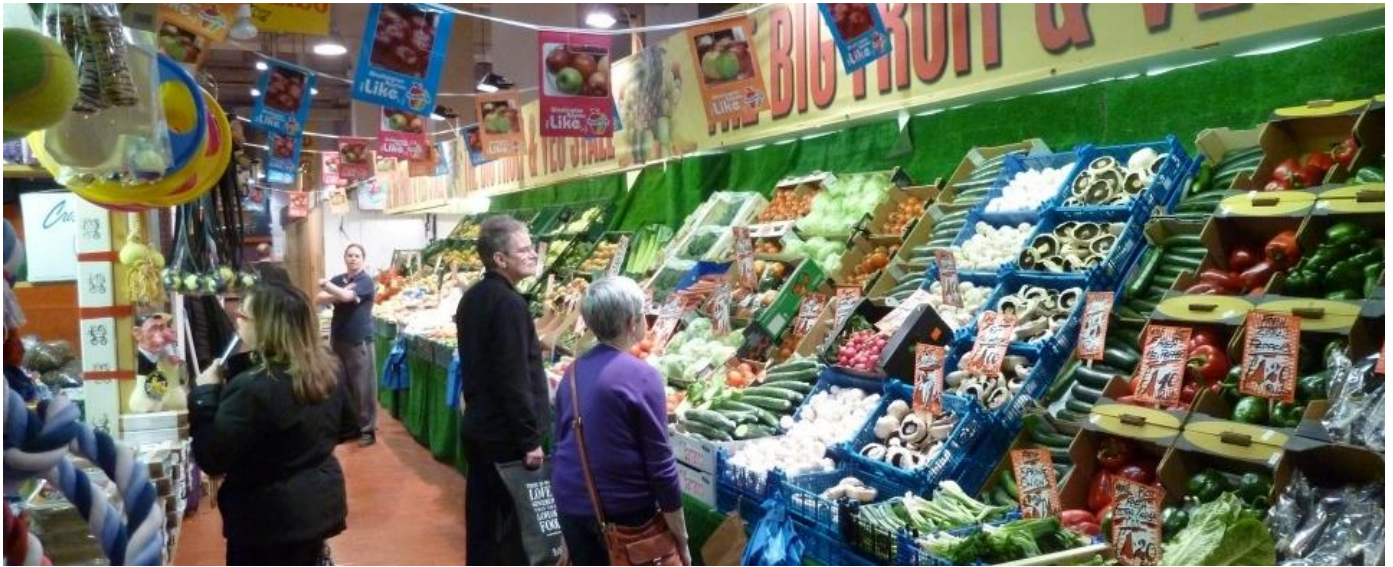
Watford Market in the Charter Place Shopping Centre, owned by Watford Borough Council until April 2013

Watford Borough Council selected the Atrium Enterprise Asset Management (EAM) solution for their strategic property asset management – Phase 1 was completed in just 6 weeks